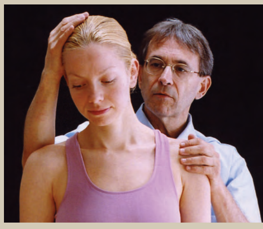
Resisted side-flexion of the neck.

being moved by the therapist—test for injury to structures that do not initiate movement (ligaments, joints, and bursas). In active tests, the person moves her body through space by herself. This simultaneously tests both the structures that initiate movement and those that do not, making it difficult to tease out what is causing the pain.<sup>10</sup>