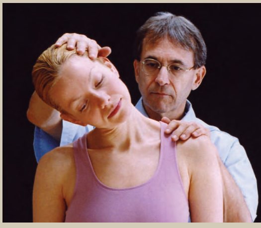
Passive side-flexion of the neck.