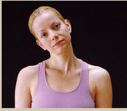
Active side-flexion of the neck.

In orthopedic assessment, passive and resisted tests provide more useful information than active tests. Below are photos of a single movement—side-flexion of the neck performed in each of those three ways.